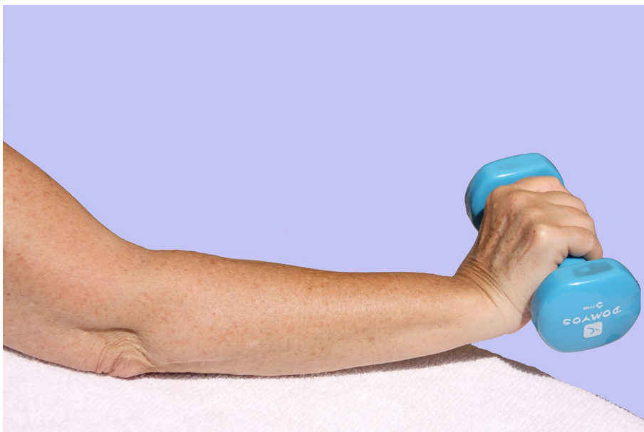
Fig 2 Strengthening exercises. They are based on resisting wrist extension (arm resting on a table with the elbow extended), such as by slowly lowering and raising a 2 lb (0.9 kg) weight held palm-down (or by using a stretch band) for three sets of 10-15 repetitions daily for about 6-12 weeks. A wrist cock-up brace or epicondylar counterforce brace (elbow brace) can be used based on patient preference. Counterforce bracing over the wrist extensor muscle bellies distributes forces from the forearm extensors away from their origin.